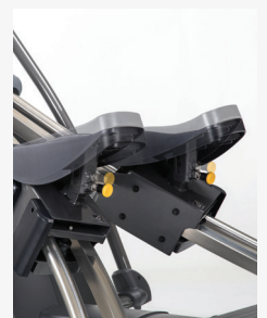
Adjustable Foot Pedal