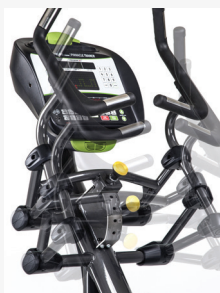
5 position, 4-Bar Linkage