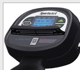
LCD Digital Display