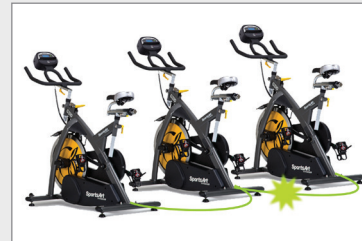
Connect Multiple Units