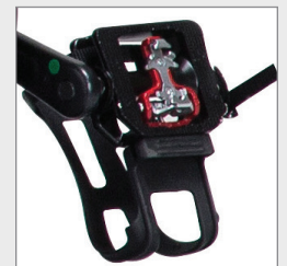
Optional Dual-Clip Foot Pedal