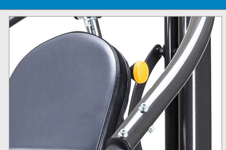
Back rest adjustment knob easily changes angle for shoulder press, incline chest press and chest press exercises

Dual Function Series allows users to work at least 2 major muscle groups per machine maximizing both space and convenience