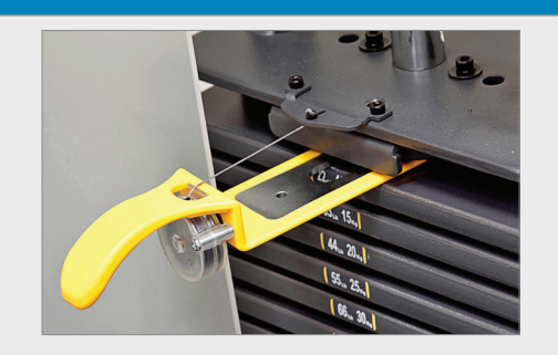
Our stacks feature sound dampeners and magnetized selector fork for maximum stability.