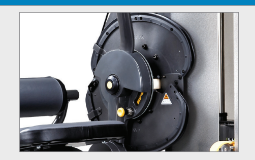
Dual cam system improves biomechanics and reduces cable slack